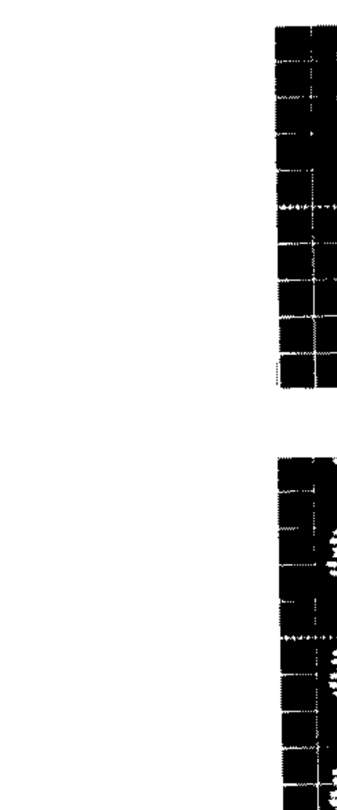
DC voltages are measured by a VOM with 20K \Omega /V input impedance when S14 is ON.